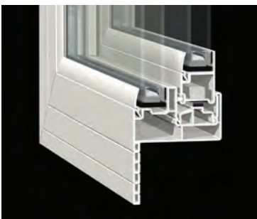
Available with an optional stucco protector mainframe.